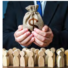
KPI Score Card