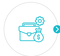
Wealth Management Firms